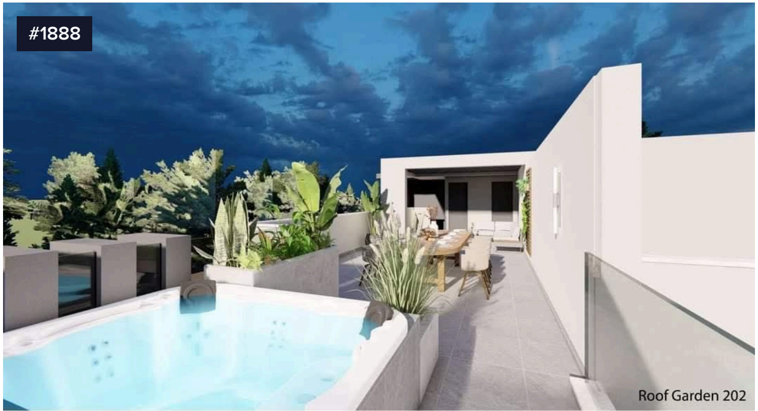
Roof Garden 202